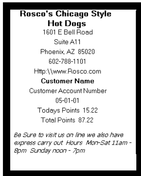
Fig 3 - Sample Receipt

When a customer makes a purchase at a participating store they will pay as normal and hand the cashier their VIP card. The employee will swipe the card and enter the amount of the purchase. That's it everything else happens without any user intervention. The Retail Station Computer will connect to the Server by phone (similar to your credit card terminal) and transmit the sales information, the server will transfer the information to be printed on the Quick Rewards receipt. The receipt (Fig 3) will be printed and the cashier will hand the receipt to the customer.