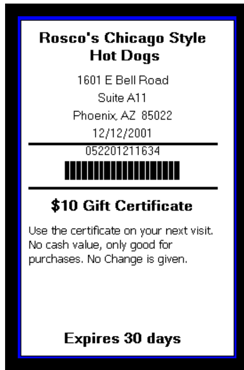
Fig -4 Sample Gift Certificate