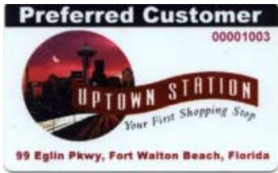
Fig 1 – VIP Card

Sign Up Process A customer will see the counter display at the store, will ask about it. The store employee will explain the Quick Rewards system and give the customer an application (Fig 2) to fill out. After the customer complete the application they will return it to the store employee and the store employee will give the customer his new Preferred Customer card (Fig 1), writing the card number on the application. The Store employee should also mention to the customer that their VIP card will only be active after the application has been entered into the database by the mall office and this process usually takes 24 hours. However the customer can take any store receipts from today to the mall office and the office employee will make note to apply points for today's purchases based on receipts that are presented by the customer.